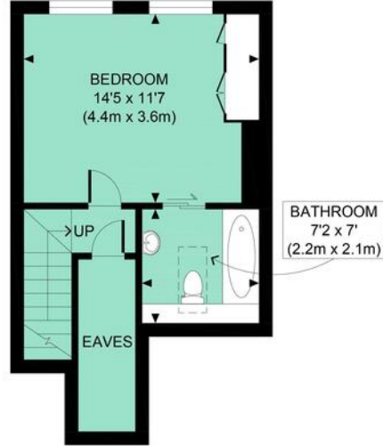
SECOND FLOOR GROSS INTERNAL FLOOR AREA 305 SQ FT