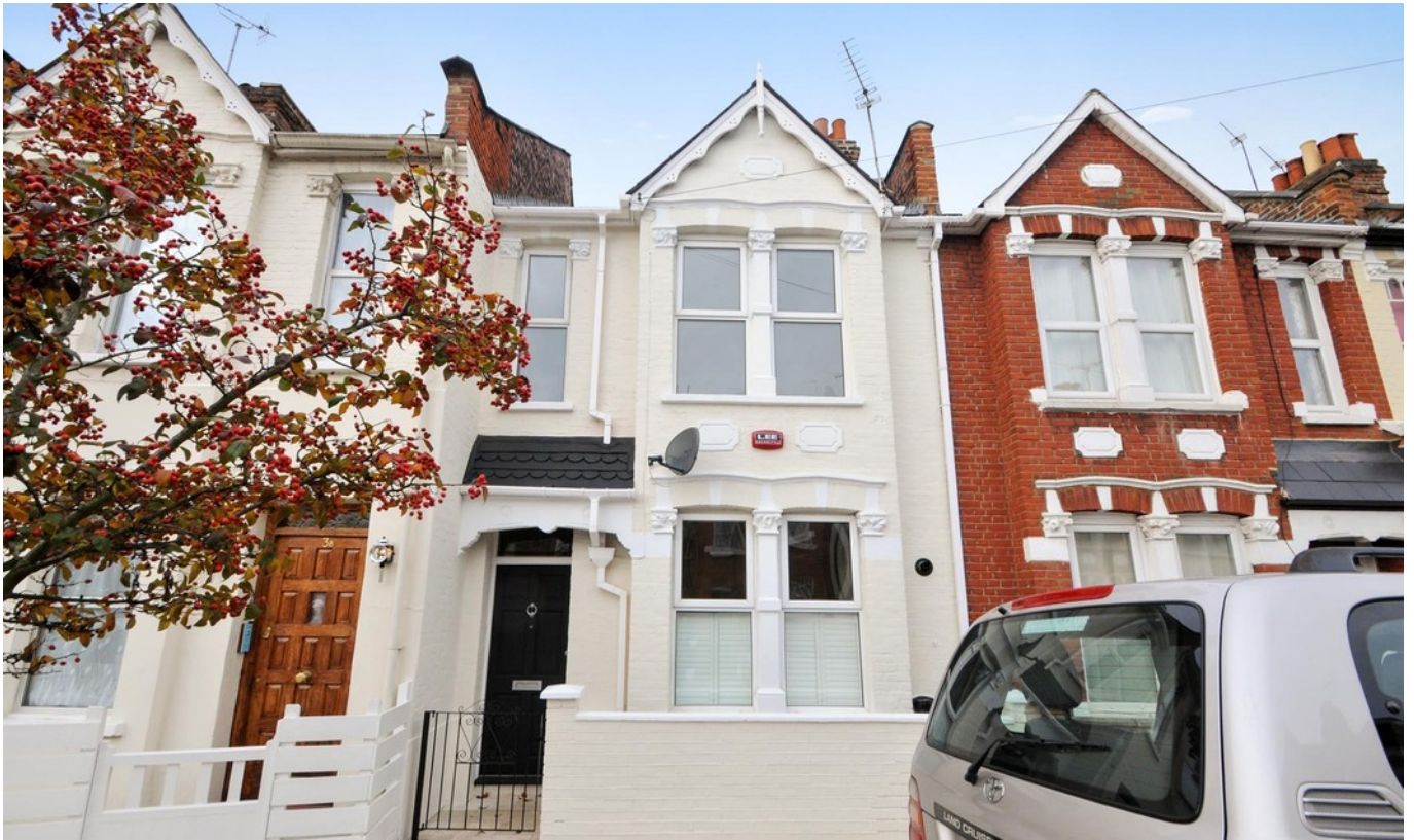
THORPEBANK ROAD W12 • SHEPHERD'S BUSH £595 PW / £2578 PCM