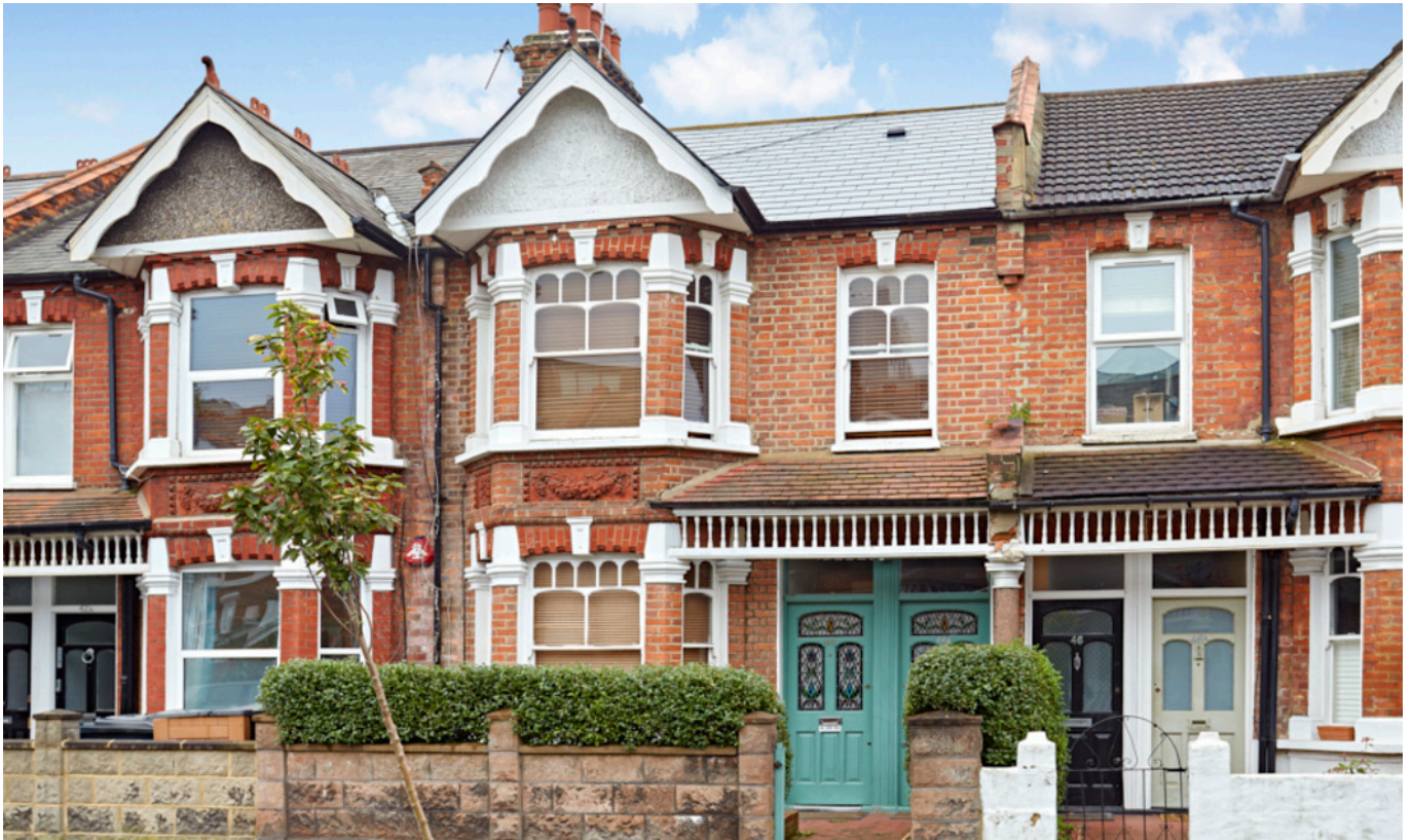
VALETTA ROAD W3 • ASKEW ROAD AREA £595,000 SHARE OF FREEHOLD