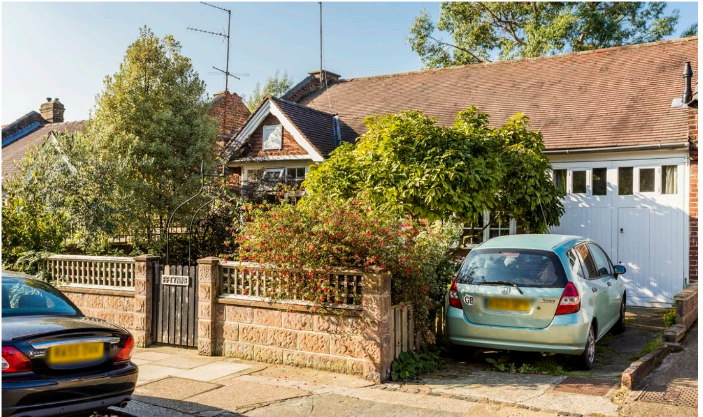
RYLETT CRESCENT W12 • WENDELL PARK GUIDE PRICE £1,250,000 FREEHOLD