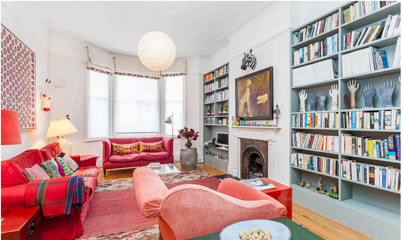
BOSCOMBE ROAD W12 • SHEPHERD'S BUSH £595 PW / £2578 PCM