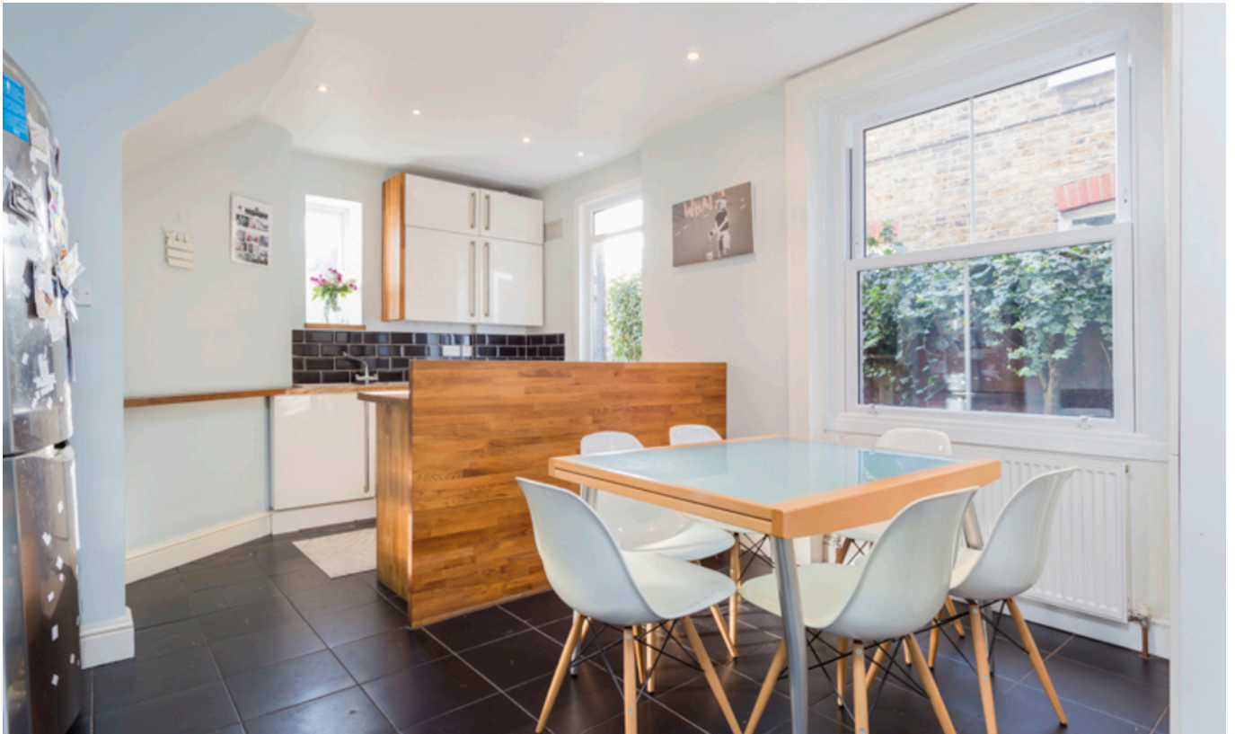
EMLYN ROAD W12 • WENDELL PARK £399 PW / £1729 PCM