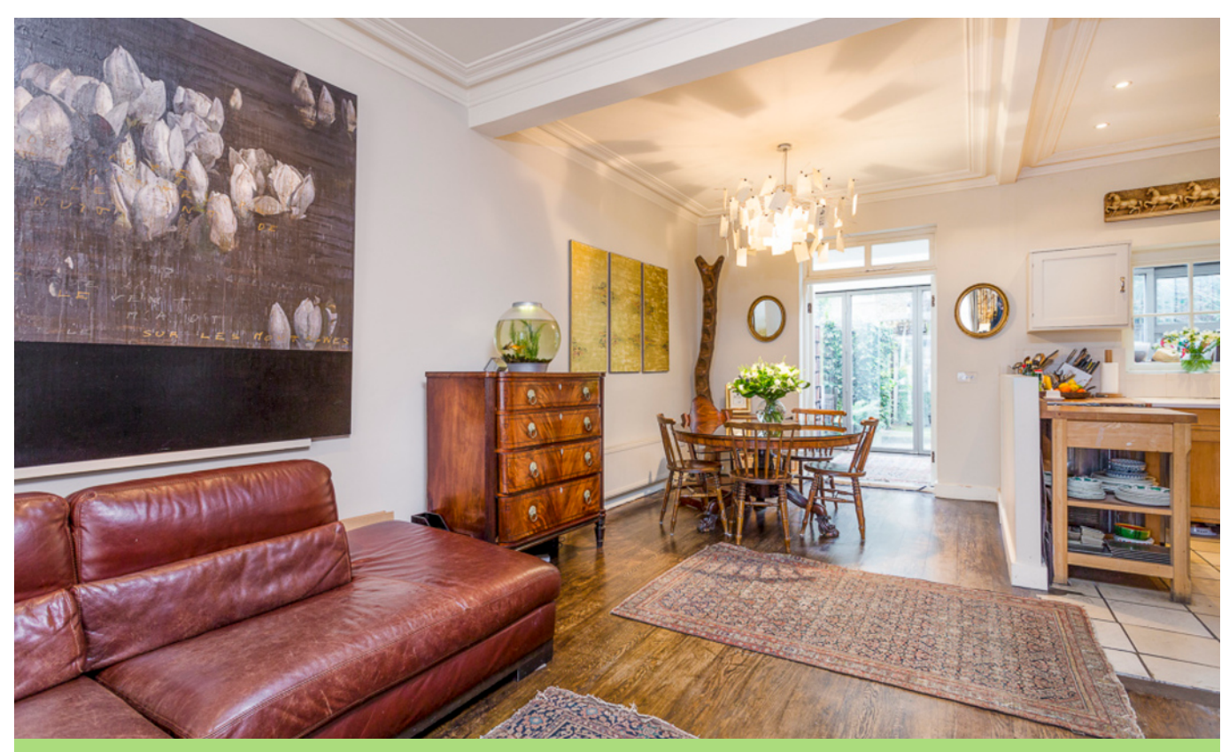
OVERSTONE ROAD W6 • BRACKENBURY VILLAGE £825 PW / £3575 PCM