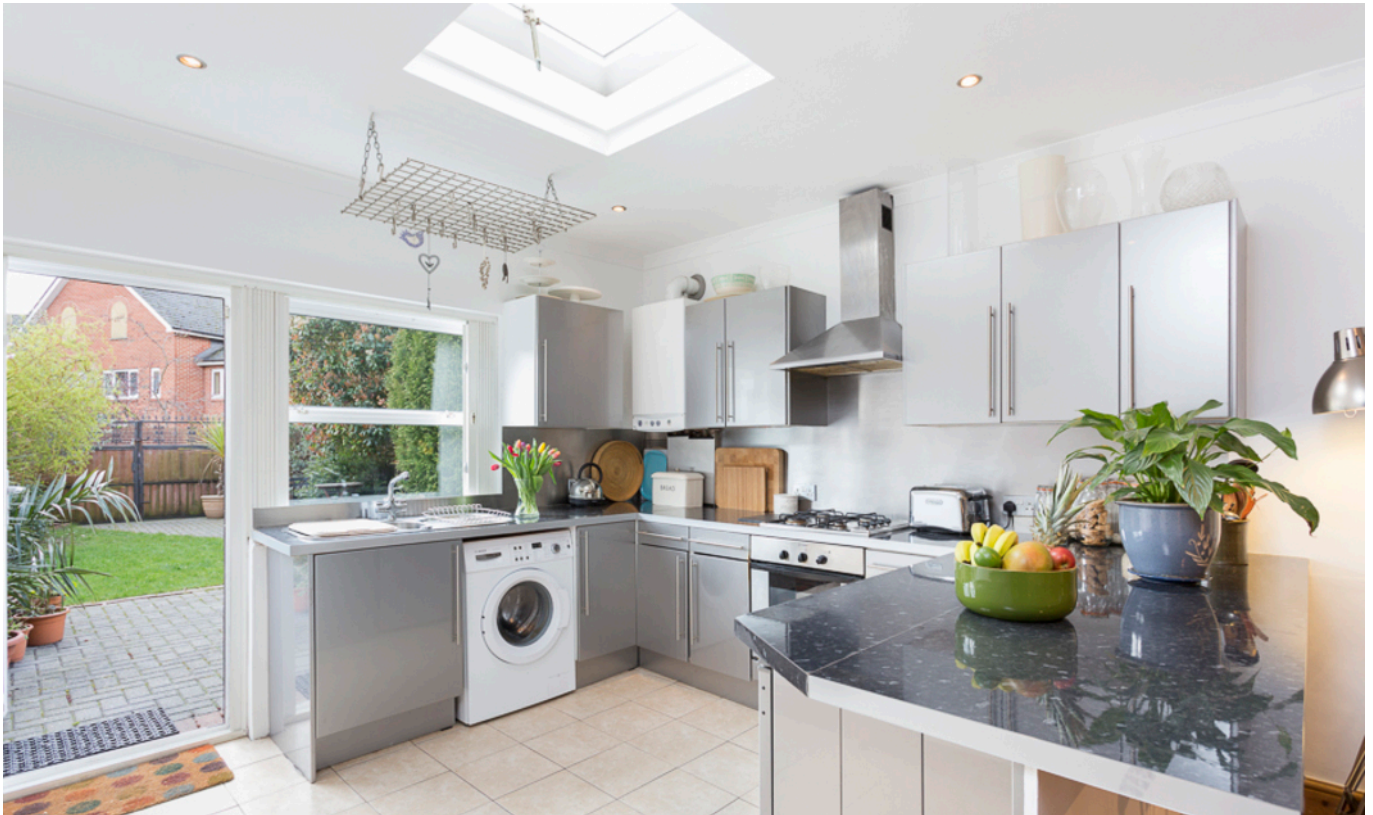
VALETTA ROAD W3 • ASKEW ROAD AREA £665,000 SHARE OF FREEHOLD