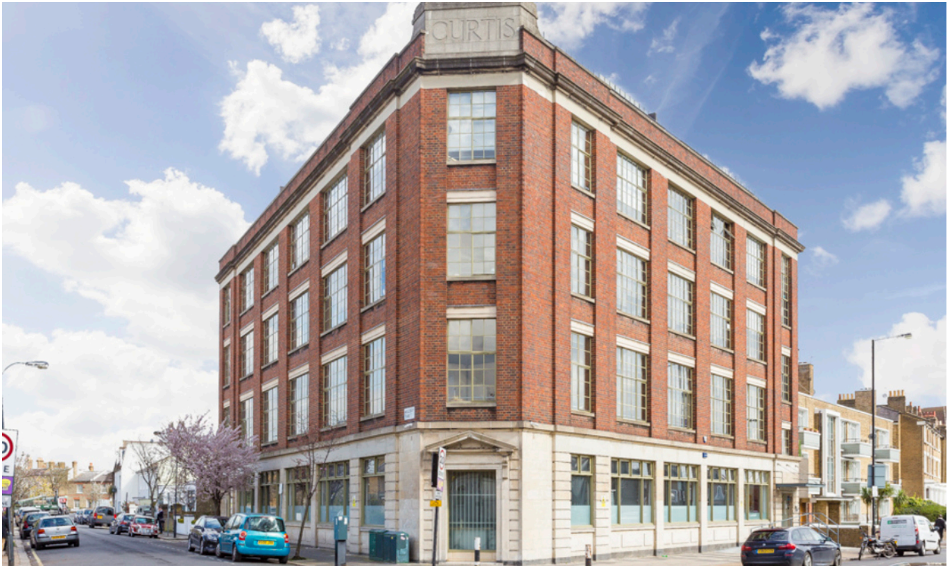
CURTIS BUILDING, PADDENSWICK ROAD W6 • BRACKENBURY VILLAGE £625 PW / £2708 PCM