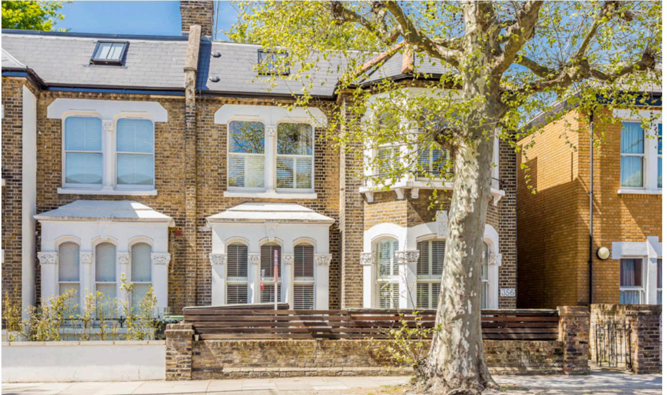
GOLDHAWK ROAD W12 • STAMFORD BROOK £325 PW / £1408 PCM