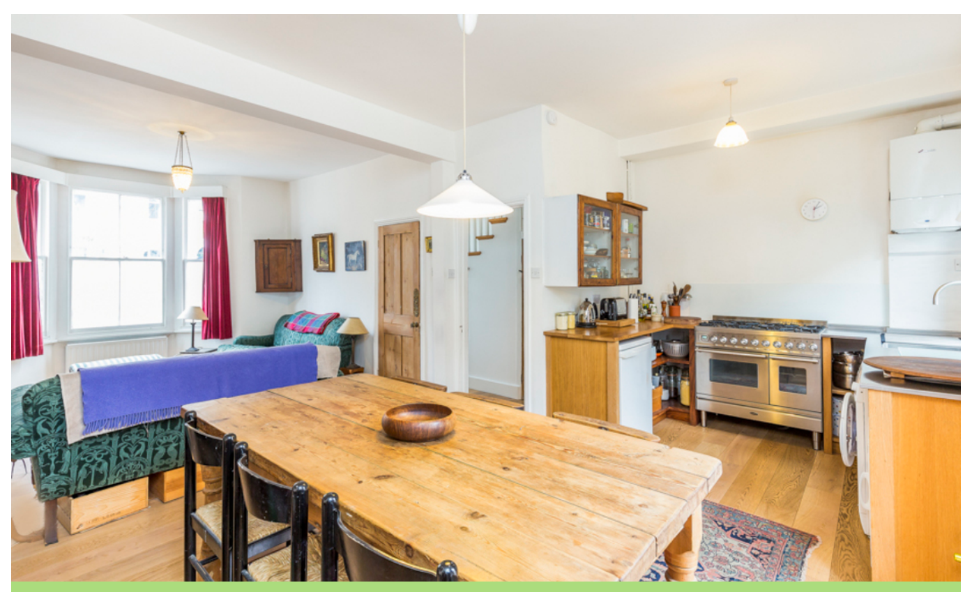
TUNIS ROAD W12 • SHEPHERD'S BUSH £525 PW / £2275 PCM