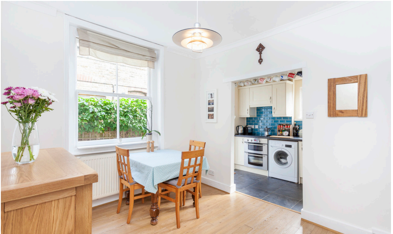
AYLMER ROAD W12 • WENDELL PARK WEEKLY RENTAL OF £395