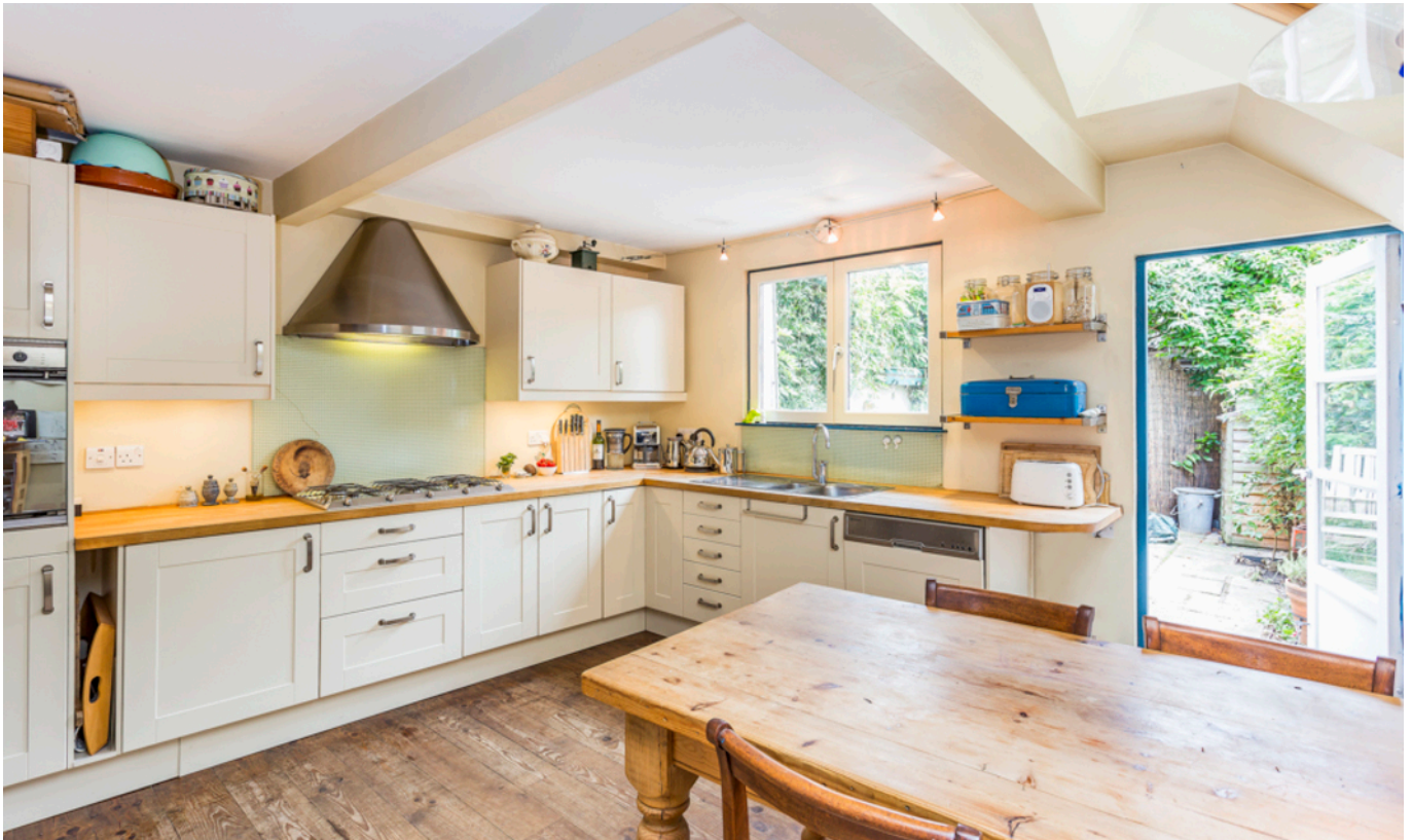
BECKLOW ROAD W12 • WENDELL PARK £575 PW / £2491 PCM