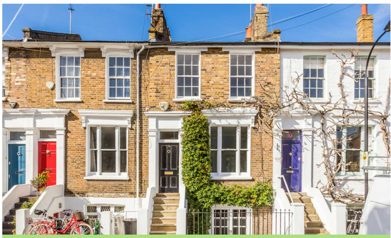
CHANCELLORS STREET W6 • RIVERSIDE £850 PW / £3683 PCM