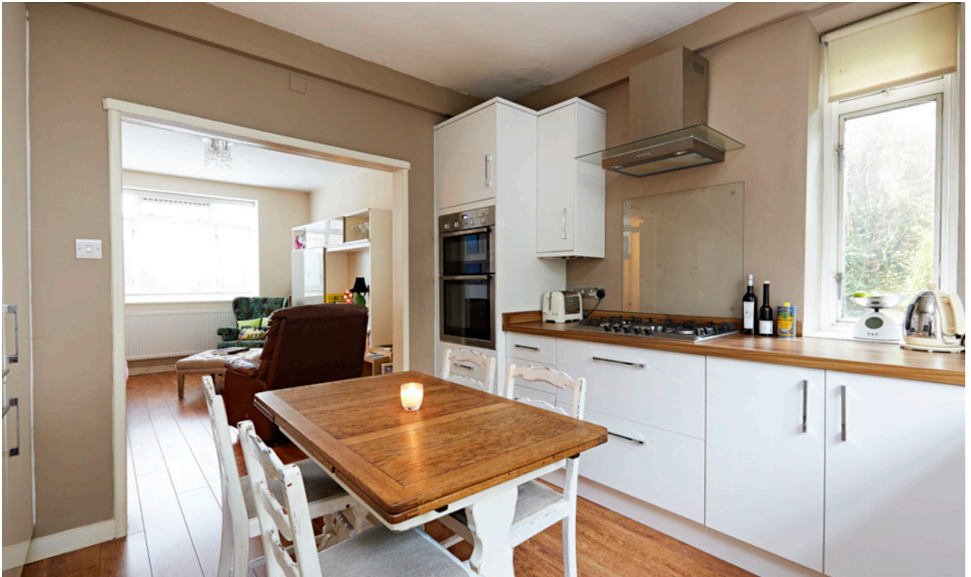
PERCY ROAD W12 • ASKEW ROAD AREA £345 PW / £1495 PCM