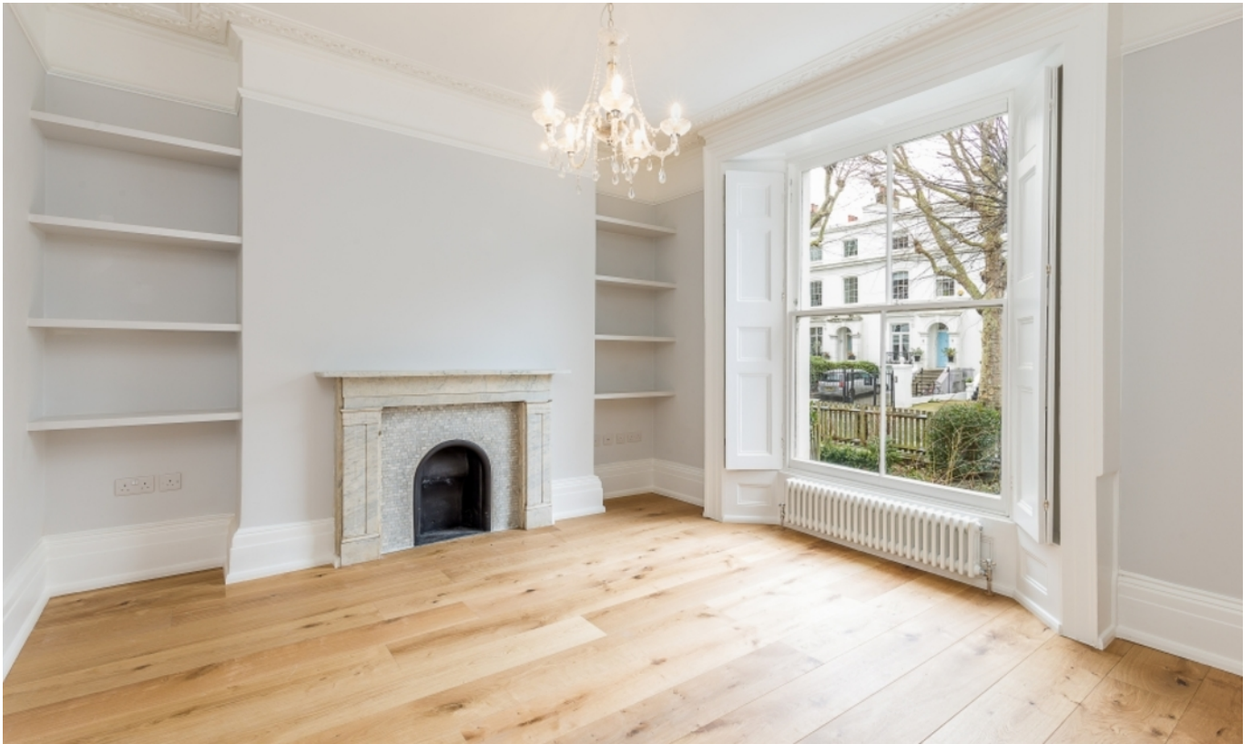
HAMMERSMITH GROVE W6 • SHEPHERD'S BUSH £461 PW / £2000 PCM