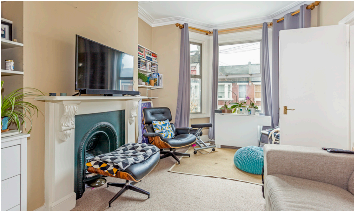
DAVISVILLE ROAD W12 • ASKEW ROAD AREA £275 PW / £1192 PCM