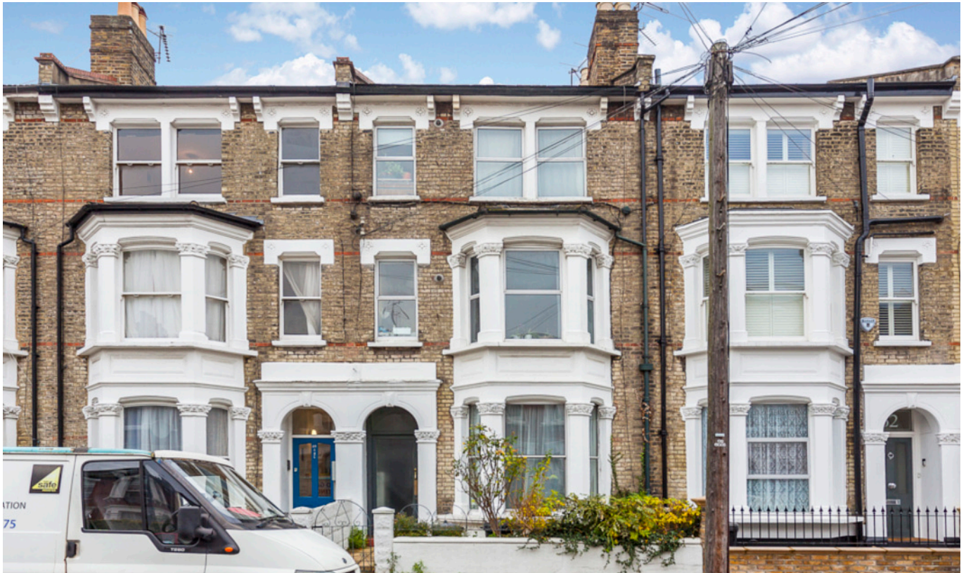
DAVISVILLE ROAD, LONDON • ASKEW ROAD AREA £165 PW / £715 PCM