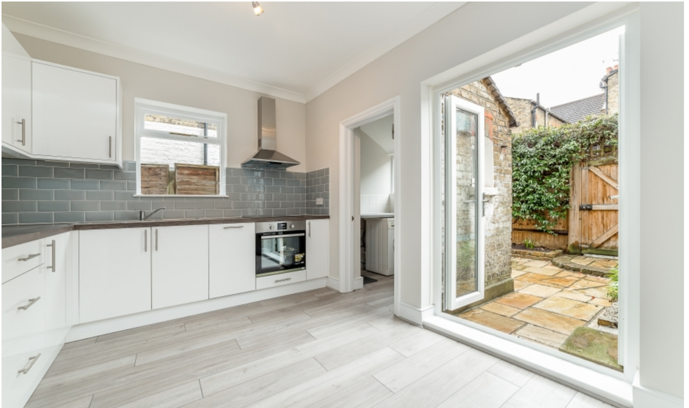
ST ELMO ROAD W12 • ASKEW ROAD AREA £525,000 SHARE OF FREEHOLD