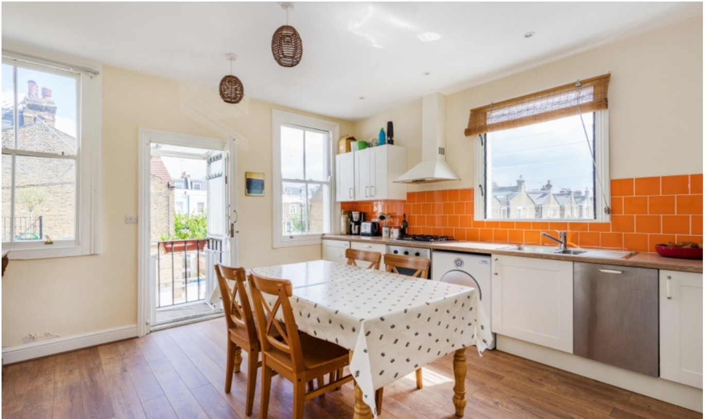
DAVIS ROAD W3 • ASKEW ROAD AREA £695,000 SHARE OF FREEHOLD