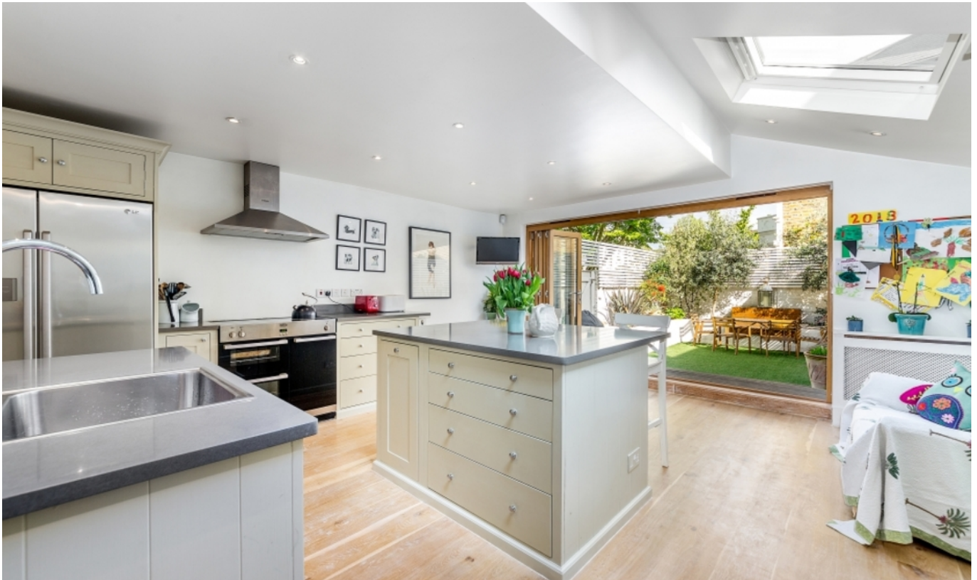
WENDELL ROAD W12 • WENDELL PARK £1,295,000 FREEHOLD