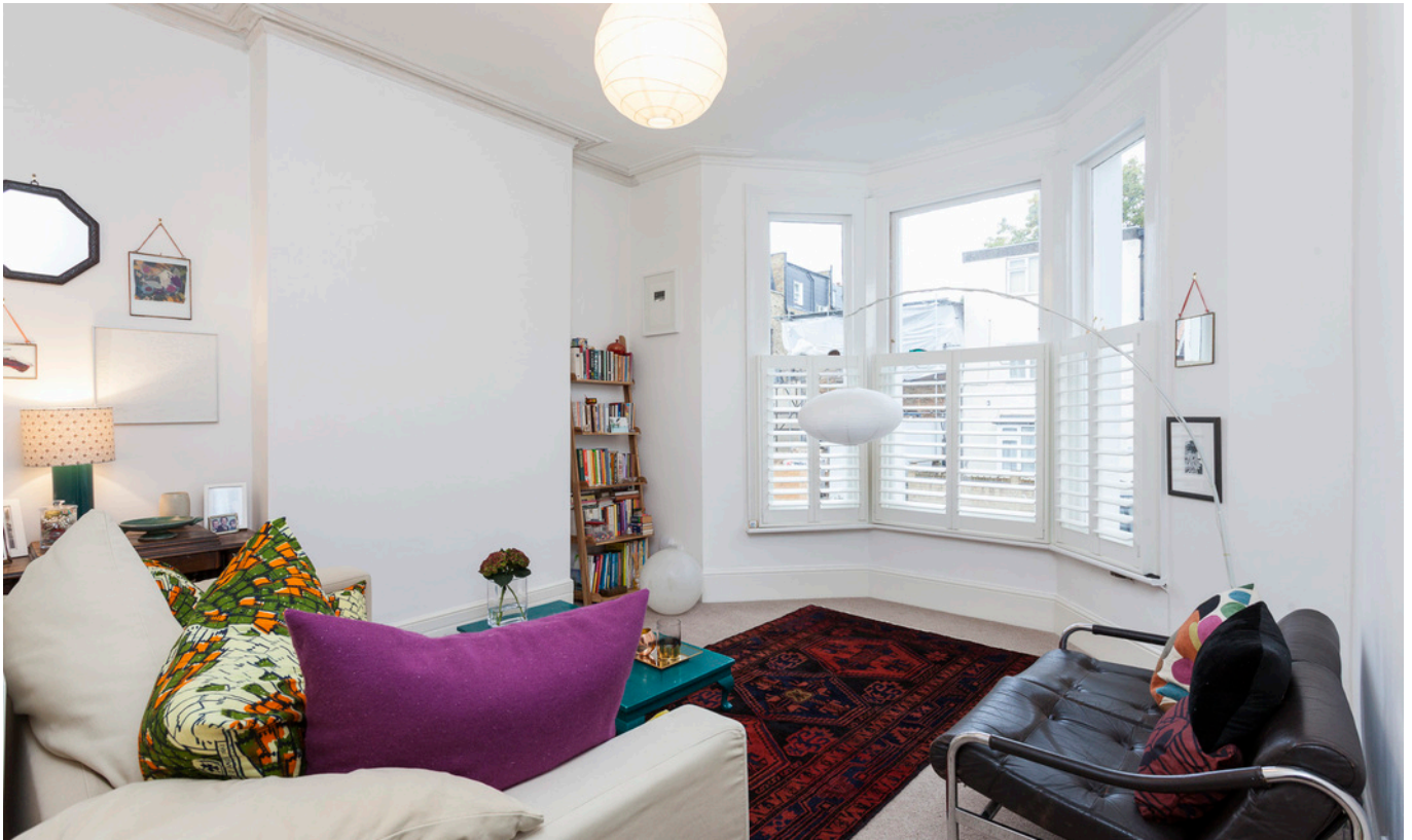
ASKEW CRESCENT W12 • ASKEW ROAD AREA £299 PW / £1,296 PCM