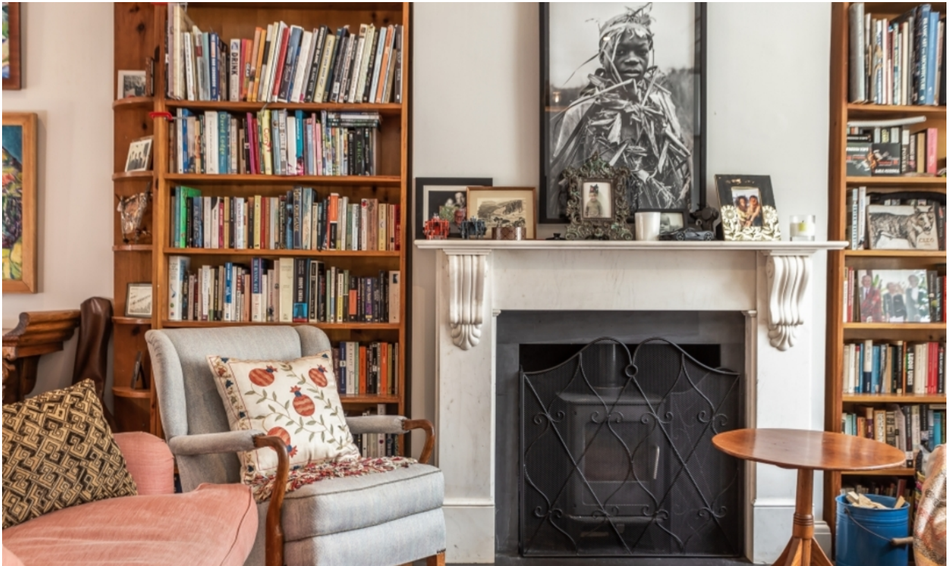
DAVISVILLE ROAD W12 • ASKEW ROAD AREA £900 PW / £3900 PCM