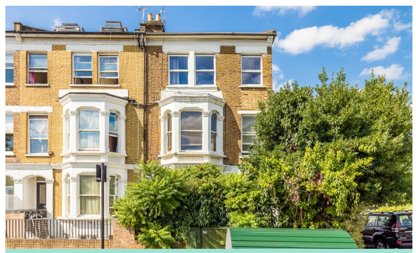
BASSEIN PARK ROAD W12 • ASKEW ROAD AREA £550,000 SHARE OF FREEHOLD