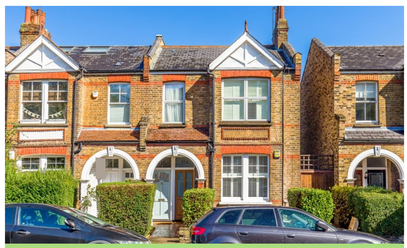
EMLYN ROAD W12 • WENDELL PARK £461 PW / £2000 PCM