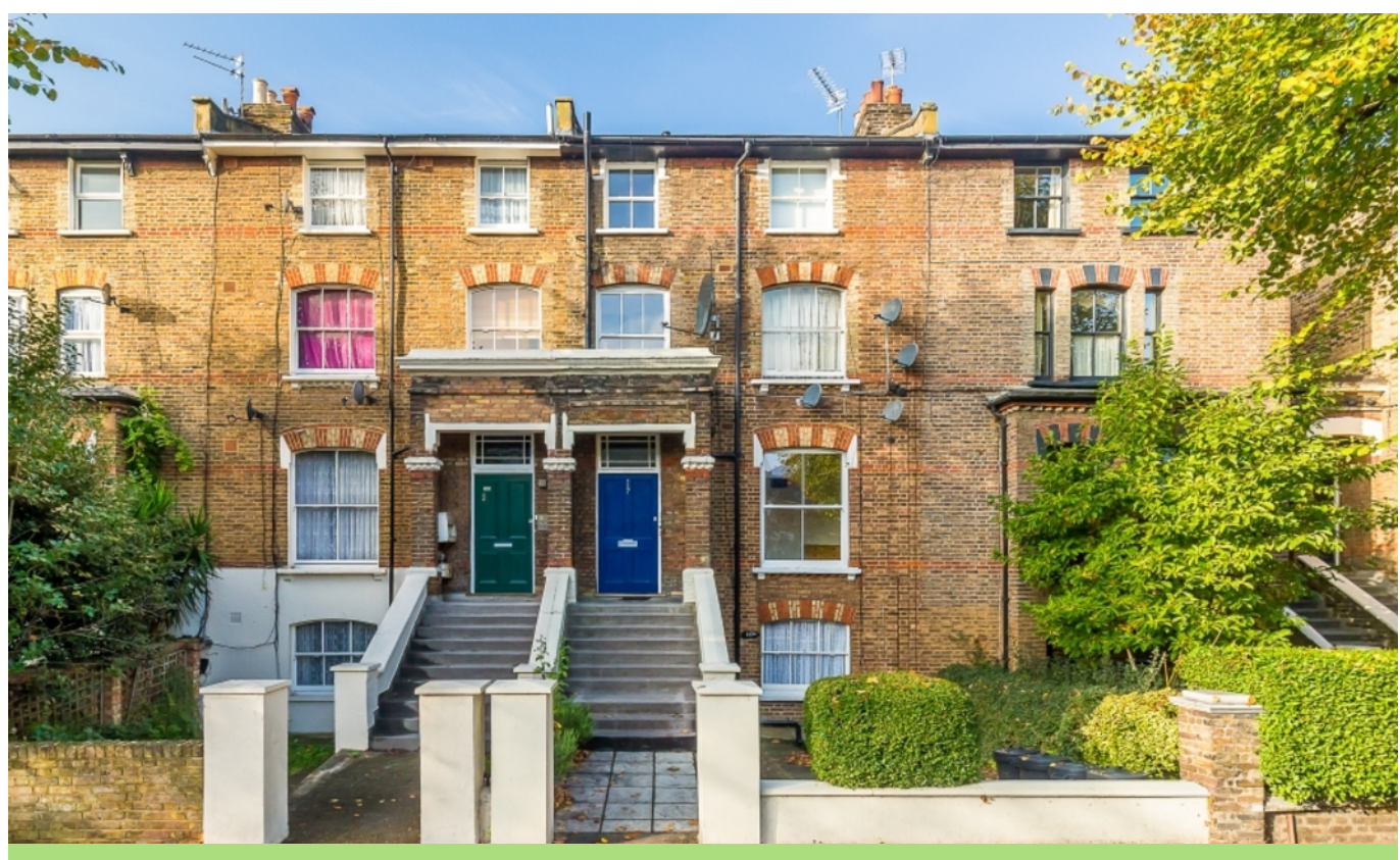
CONINGHAM ROAD W12 · SHEPHERD'S BUSH £320 PW / £1386 PCM