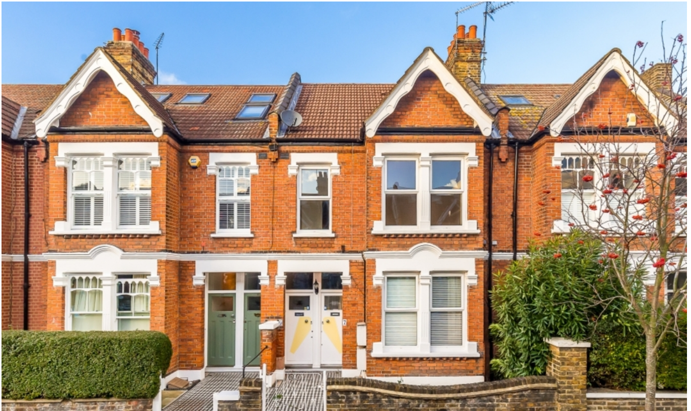
JEDDO ROAD W12 • ASKEW ROAD AREA £495,000 SHARE OF FREEHOLD