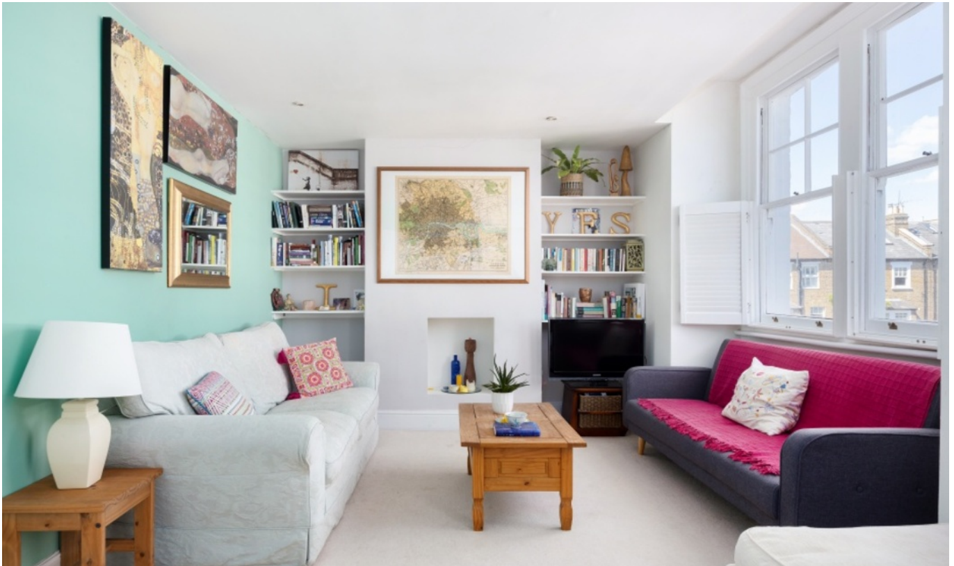
AYLMER ROAD W12 • WENDELL PARK £695,000 SHARE OF FREEHOLD