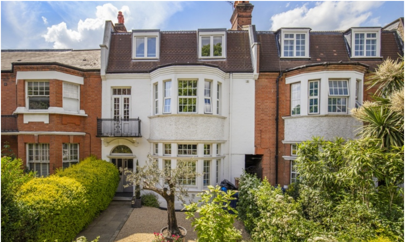
OLD OAK ROAD W3 • ASKEW ROAD AREA £1,675,000 FREEHOLD