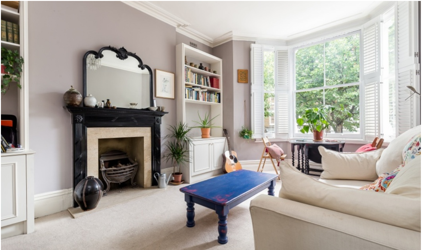
HAMMERSMITH GROVE W6 • BRACKENBURY VILLAGE £495 PW / £2145 PCM