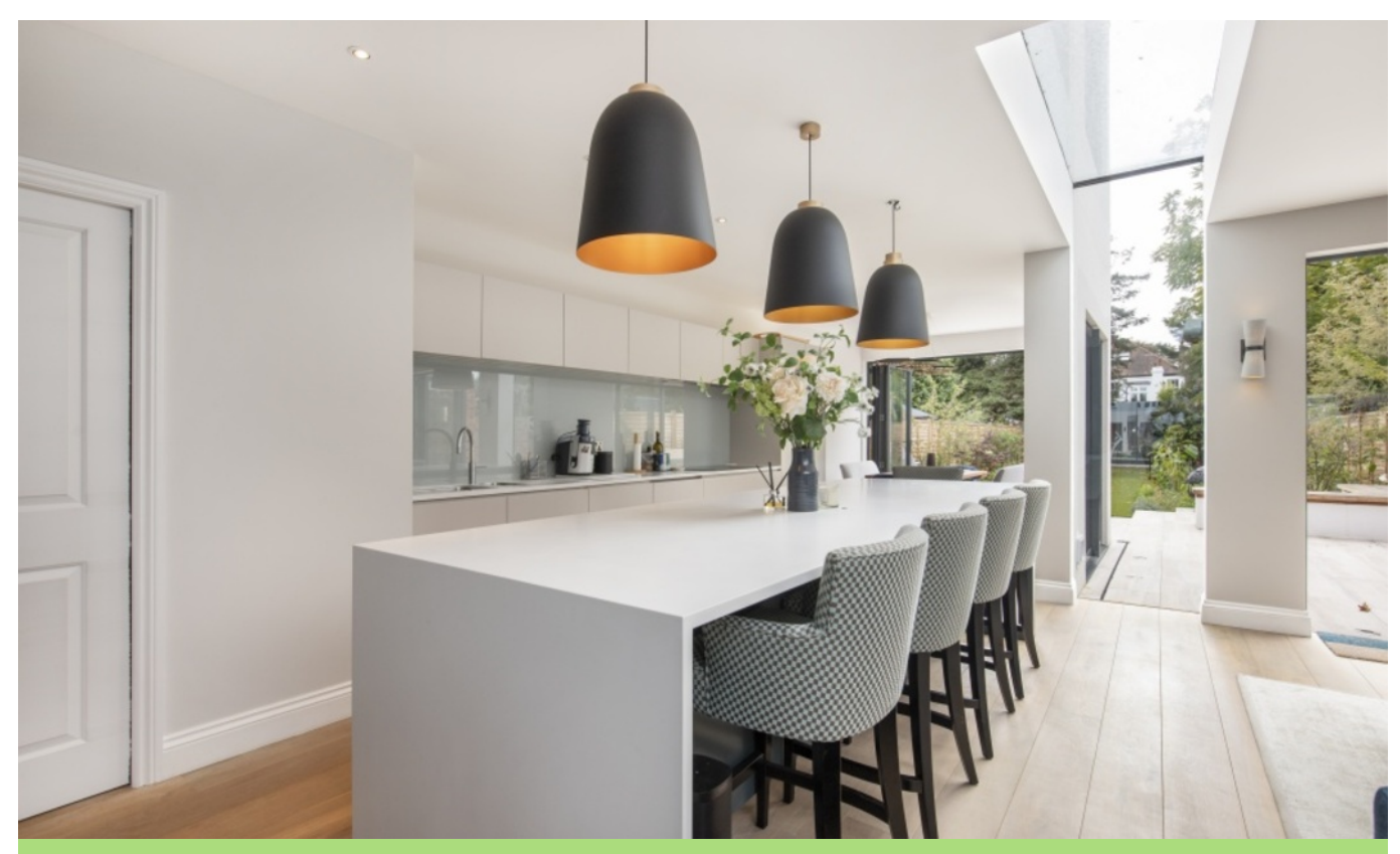
EMLYN ROAD W12 • STAMFORD BROOK £1450 PW / £6283 PCM