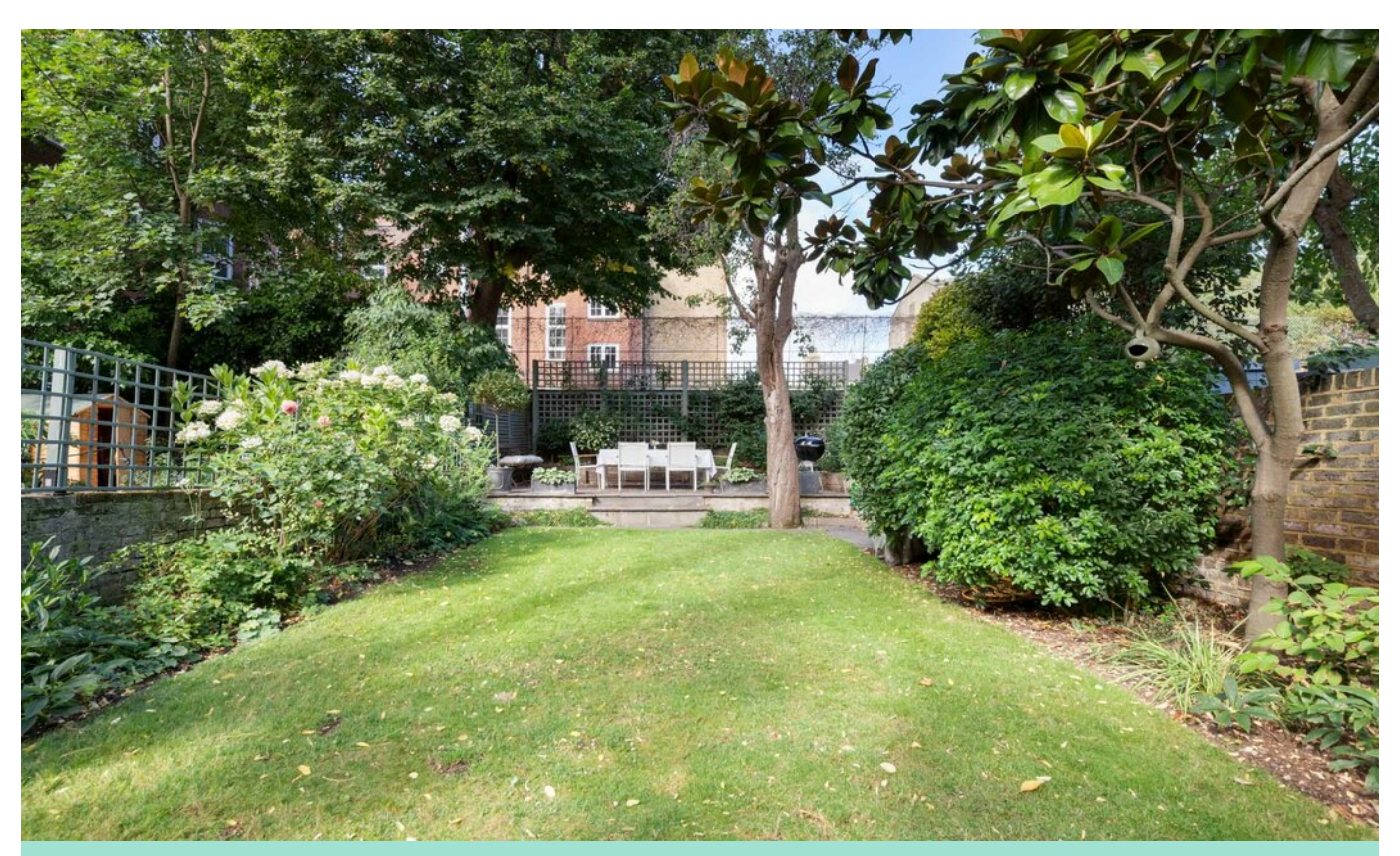
LIME GROVE W12 · SHEPHERD'S BUSH £599,000 SHARE OF FREEHOLD