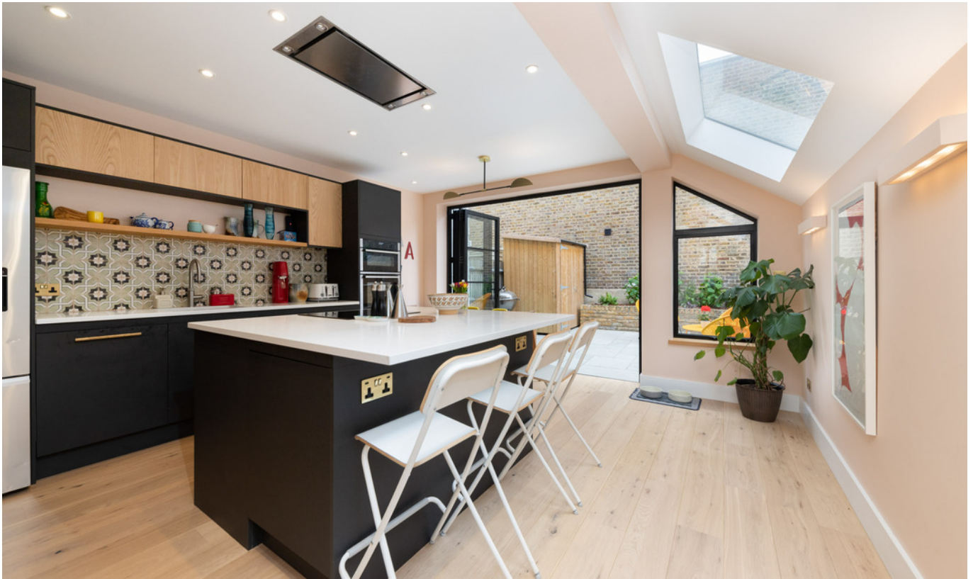
LEFROY ROAD W12 • WENDELL PARK £1,200,000 FREEHOLD