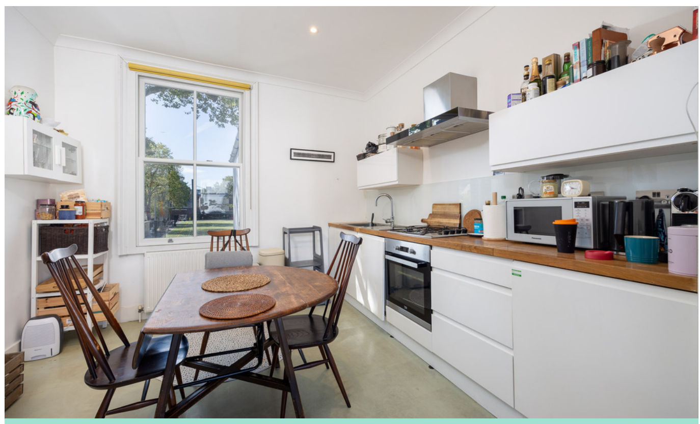
ALDENSLEY ROAD W6 • BRACKENBURY VILLAGE £650,000 SHARE OF FREEHOLD