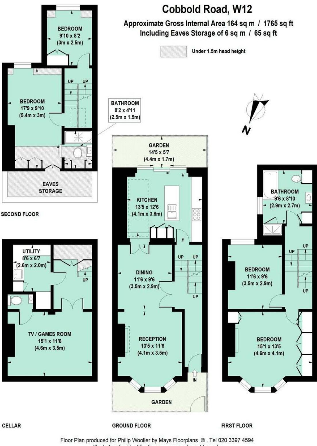
Illustration for identification purposes only, not to scale All measurements are maximum, and include wardrobes and window bays where applicable