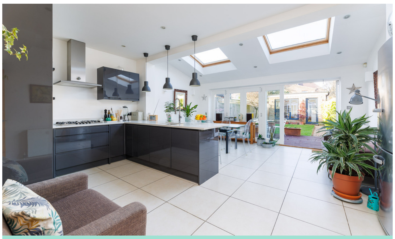
DORDRECHT ROAD W3 • ASKEW ROAD AREA £1,150,000 FREEHOLD