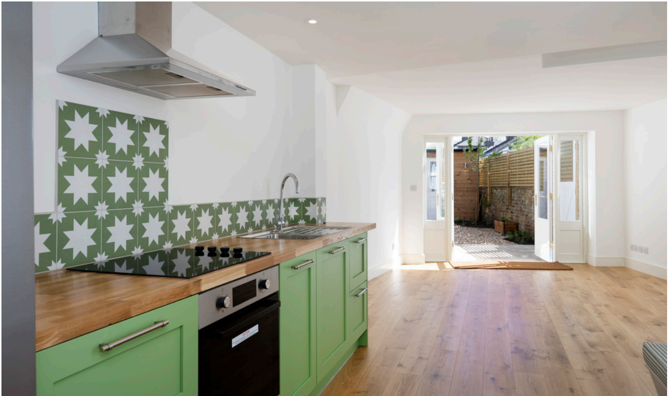
PERCY ROAD W12 • ASKEW ROAD AREA £600 PW / £2600 PCM