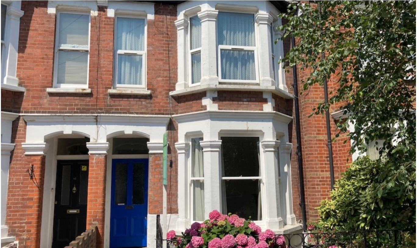
STARFIELD ROAD W12 • ASKEW ROAD AREA £320 PW / £1386 PCM