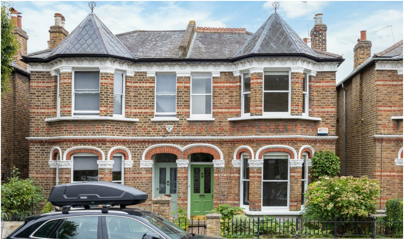
BINDEN ROAD W12 • ASHCURCH AREA £1295 PW / £5611 PCM