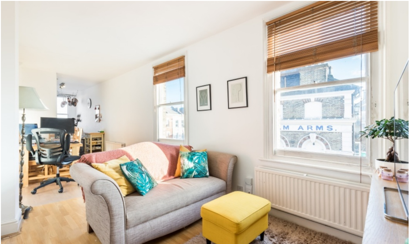
PERCY ROAD W12 • SHEPHERD'S BUSH £277 PW / £1200 PCM