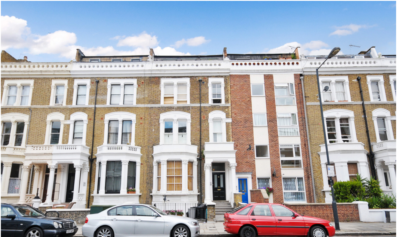
SINCLAIR ROAD W14 • BROOK GREEN £230 PW / £996 PCM