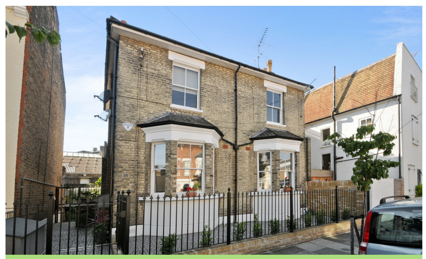
DORVILLE CRESCENT W6 • BRACKENBURY VILLAGE £395 PW / £1711 PCM