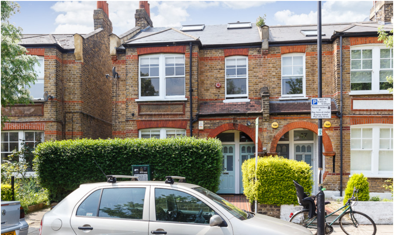
AYLMER ROAD W12 • WENDELL PARK £815,000 SHARE OF FREEHOLD