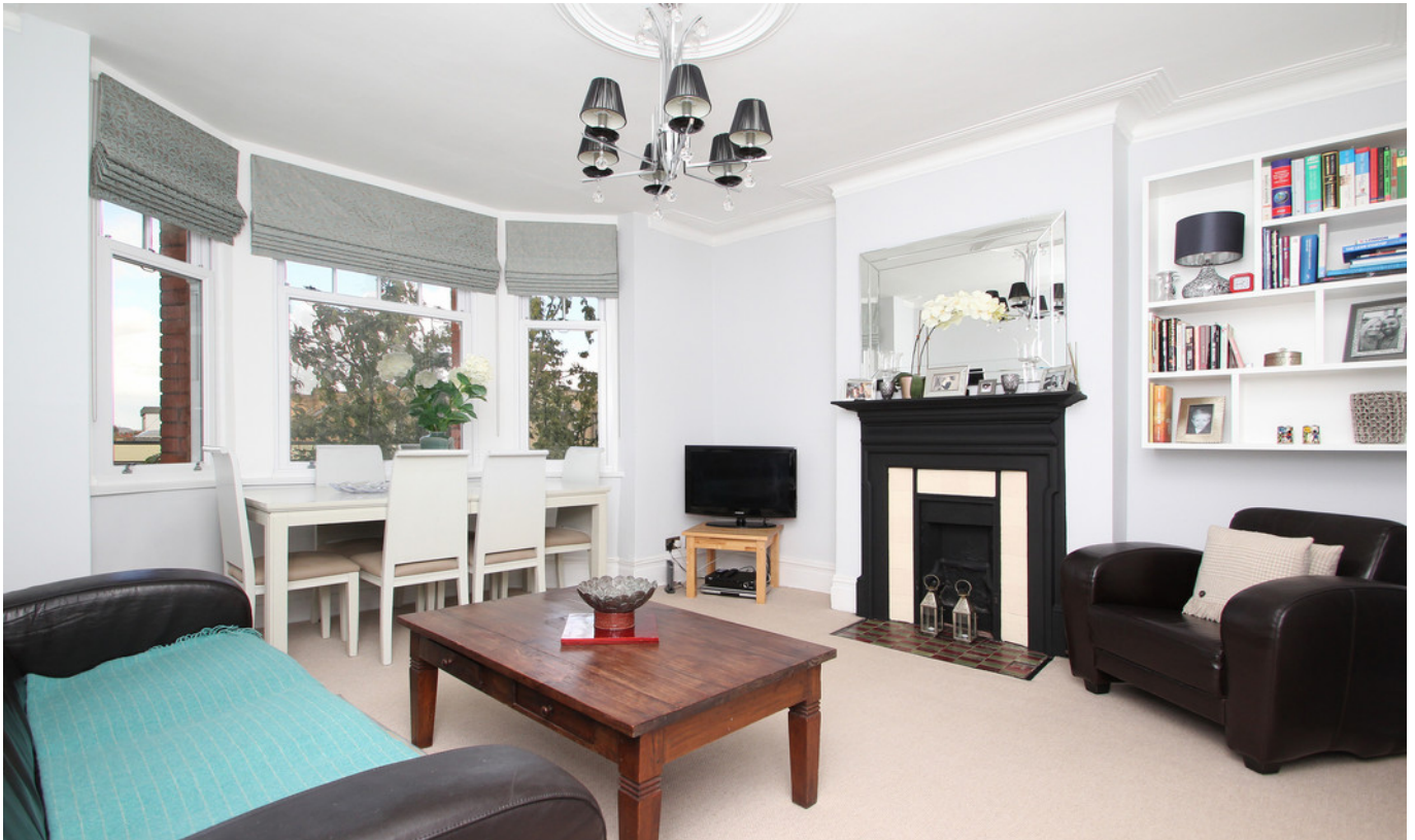
ASKEW MANSIONS W12 • ASKEW ROAD AREA £349 PW / £1512 PCM