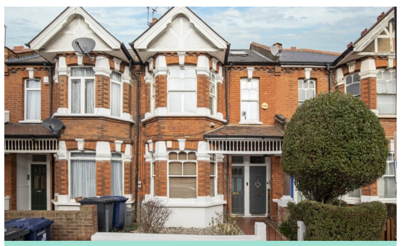
VALETTA ROAD W3 • WENDELL PARK £599,950 LEASEHOLD