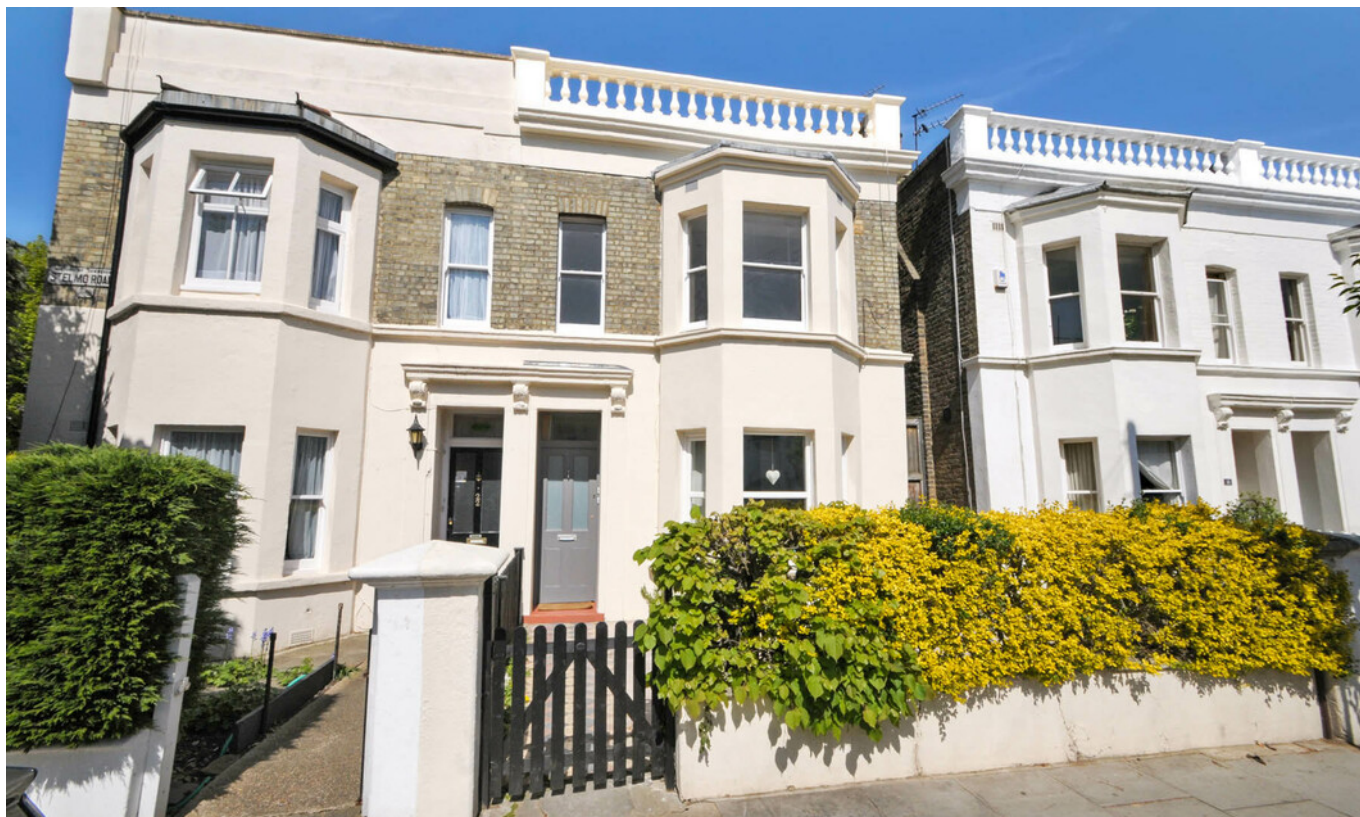
ST ELMO ROAD W12 • WENDELL PARK £299 PW / £1296 PCM