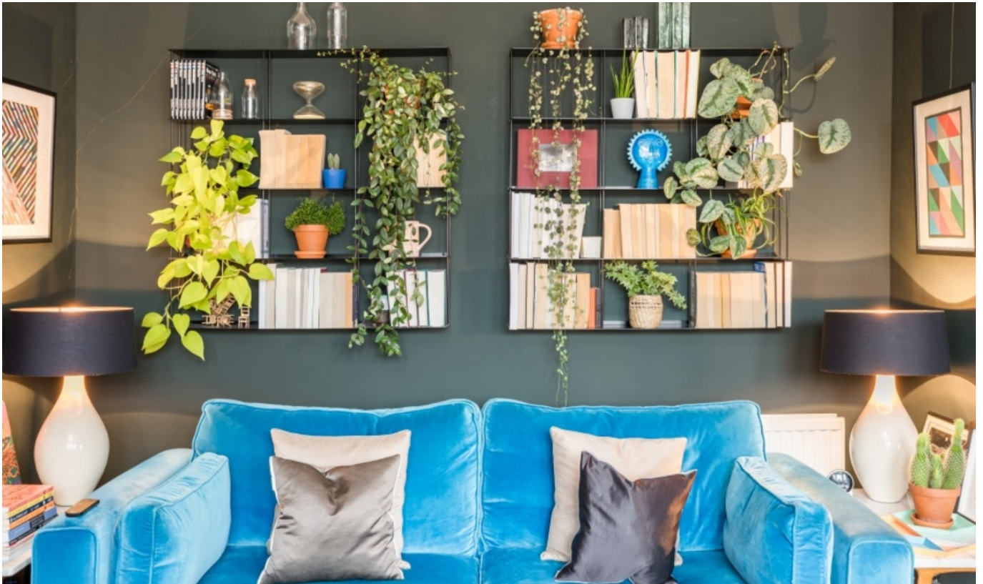
LIME GROVE W12 • SHEPHERD'S BUSH £550,000 SHARE OF FREEHOLD