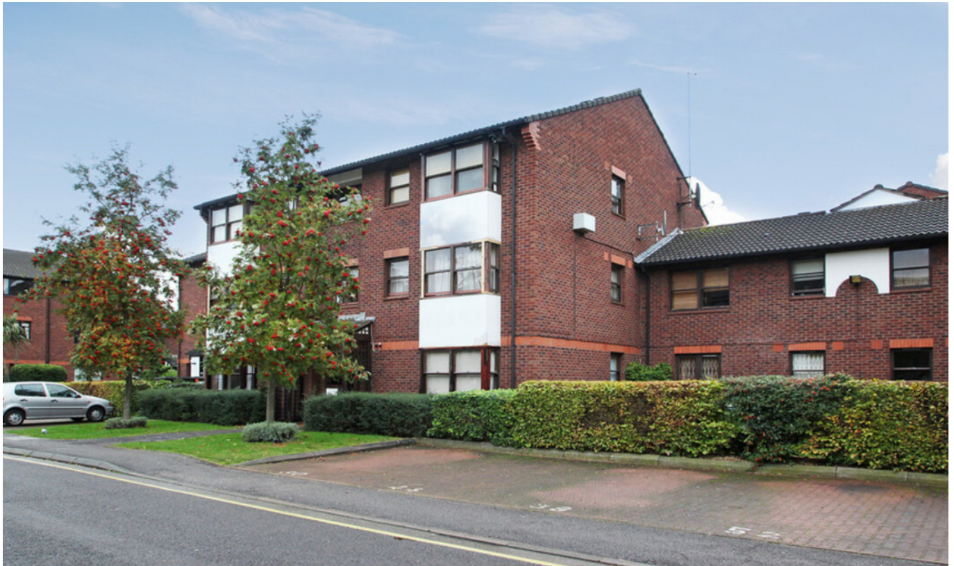
MAYFIELD ROAD W12 • WENDELL PARK £275,000 LEASEHOLD