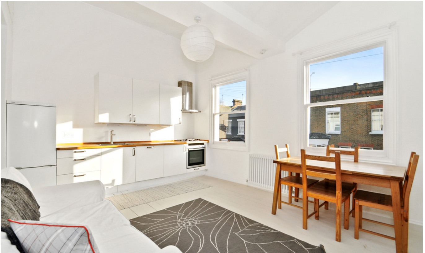
BECKLOW ROAD W12 • WENDELL PARK £323 PW / £1400 PCM