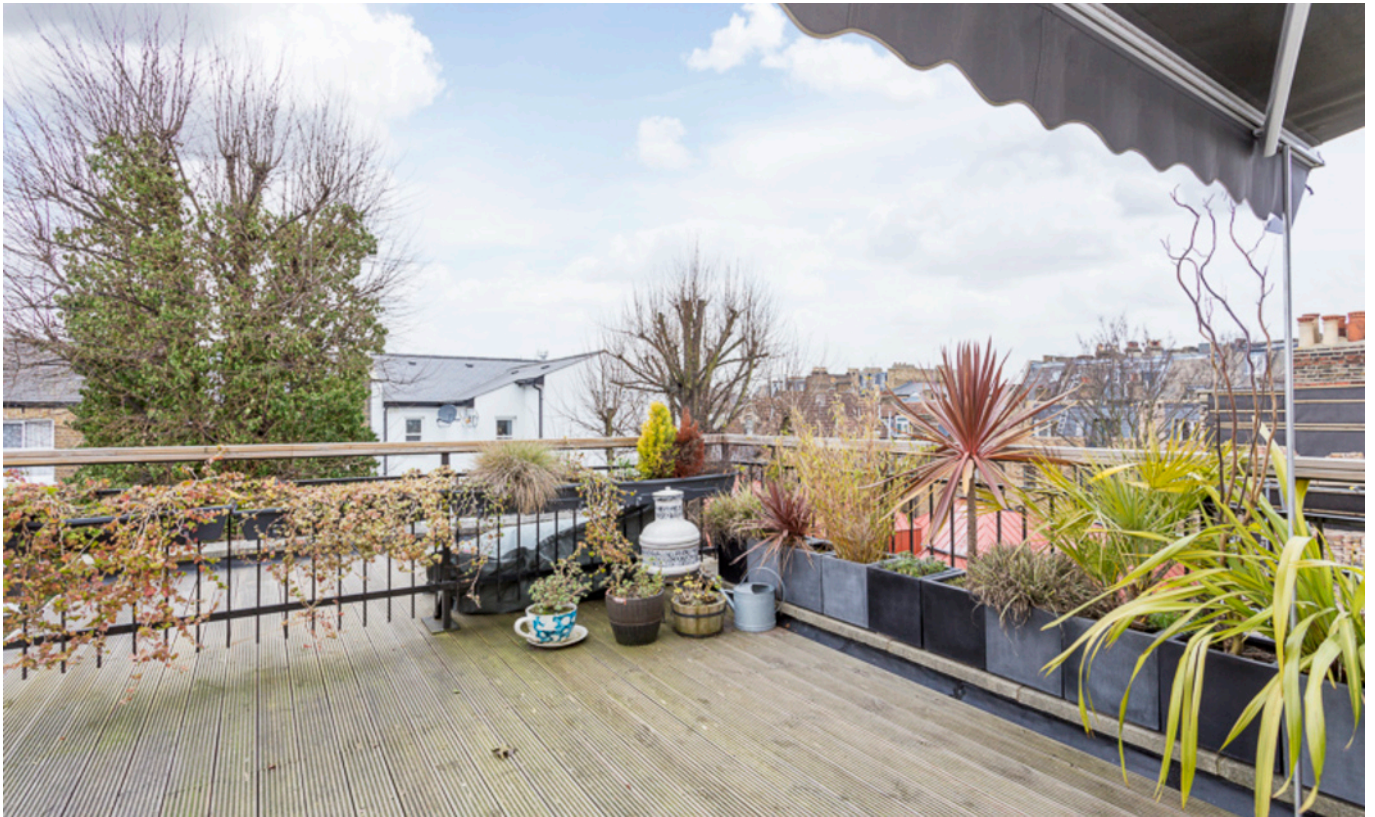
DEVONPORT ROAD W12 • SHEPHERD'S BUSH £400,000 LEASEHOLD