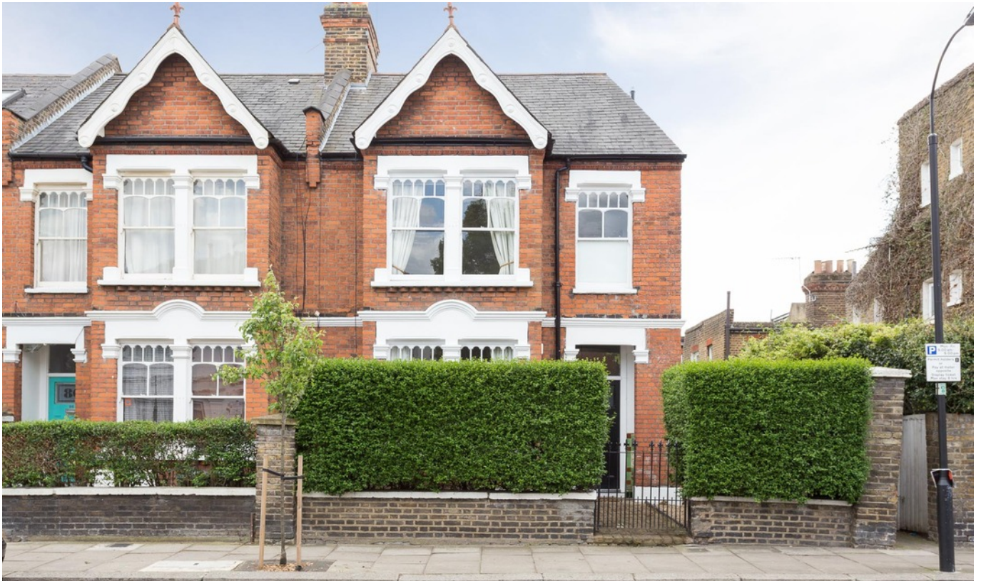
JEDDO ROAD W12 • WENDELL PARK £1,025,000 FREEHOLD